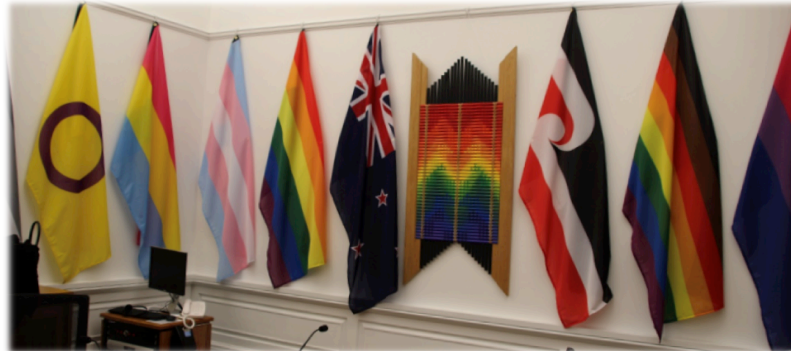
Parliament rainbow room